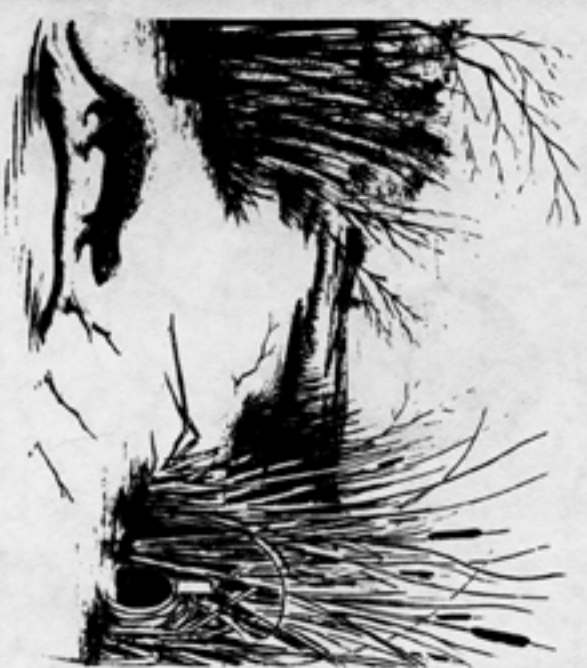
Land or Water Trapping